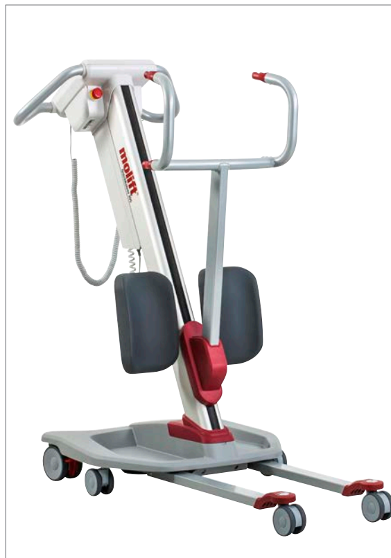
Molift QuickRaiser 205

The Active Lifting Arm (four point spreader bar) and the RgoSling Active provides extra support when hoisting from sit to stand. The inclined column encourages a natural pattern of movement and fulfills the hoisting needs of users with some weight bearing capacity. The Active Lifting Arm combined with the sling provides a comfortable, stable and safe hoisting solution.