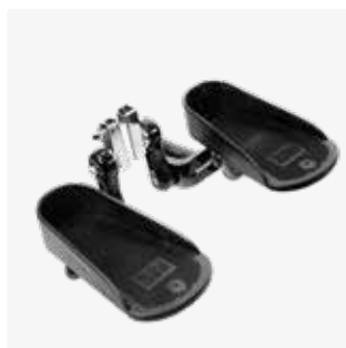
Individual angle adjustable foot supports 89143-x