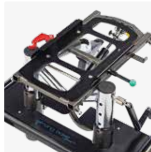
Adapter for seat mounting 8911610-99L