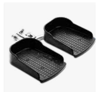
Parted foot supports 89146-x

For more accessories - visit our website