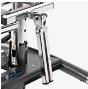
Double rod for foot supports 891084x-x