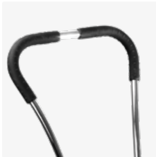
Push brace 8910545