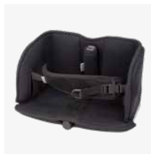
Foot plate padding 95145-xPAD Foot box kit 95145-xBOX