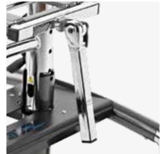
Single rod for foot supports 891082x-x