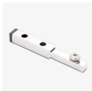
Width extension for multi-adjustable foot support 8910855