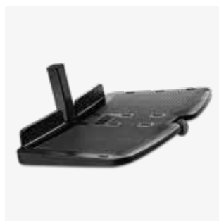
Foot plate model Wombat 95145-x